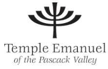
Temple Emanuel of the Pascack Valley