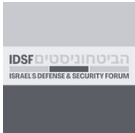
Israel Defense and Security Forum