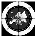
Make their Memory Shine