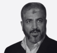
KHALED MASHAL Former Chairman of the Hamas Political Bureau

"HAMAS HAS JUST ONE 'NO'- NO TO THE EXISTENCE OF ISRAEL. I BELIEVE THAT ISRAEL IS THE HEART OF THE PROBLEM IN OUR REGION AND THAT ONCE ISRAEL IS GONE FROM THE REGION AN OPPORTUNITY TO RESOLVE ALL THE PROBLEMS IN THIS REGION WILL BE OPENED."