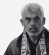
YAHYA SINWAR Head of Hamas in the Gaza Strip

"(THE QURAN SAYS:) "KILL THEM WHEREVER YOU MAY FIND THEM." "I SAY TO THE YOUNG PEOPLE IN THE WEST BANK, FROM THE VARIOUS ORGANIZATIONS: TODAY IS YOUR DAY TO SWEEP OUT THE OCCUPIERS AND THEIR SETTLEMENTS FROM ALL OUR LAND IN THE WEST BANK AND TO MAKE THEM PAY THE PRICE FOR THEIR CRIMES OVER THE LEAN YEARS. ORGANIZE YOUR ATTACKS ON THE SETTLEMENTS WITH ALL THE MEANS AT YOUR DISPOSAL."