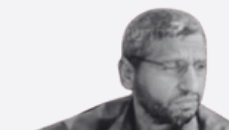
MOHAMMED DEIF Head of the Izz ad-Din al-Qassam Brigades

"ISRAEL IS A COUNTRY THAT HAS NO PLACE ON OUR LAND. WE MUST REMOVE THAT COUNTRY. WE MUST TEACH ISRAEL A LESSON, AND WE WILL DO THIS AGAIN AND AGAIN." "THE OCCUPATION MUST COME TO AN END."