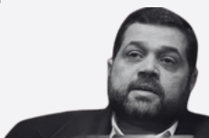
OSAMA HAMDAN Member of Hamas's politburo

"WE ARE COMING IN A ROARING FLOOD," "ONE DAY WE WILL MEET IN THE SQUARES OF JERUSALEM AND AL-AQSA CLEAN OF THE ZIONIST INVADERS, AND THERE WILL BE NO REMNANTS OF THEM IN THIS HOLY LAND."