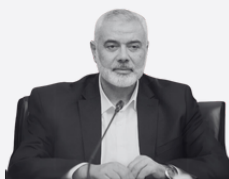
ISMAIL HANIYEH Chairman of the Hamas Political Bureau

"OCTOBER 7 PAVED A WIDE HIGHWAY TOWARDS THE REMOVAL OF ISRAEL, TOWARDS LIBERATION AND TOWARDS SAVING JERUSALEM AND AL- AQSA MOSQUE."