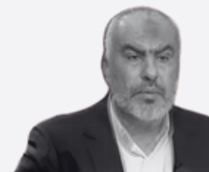
GHAZI HAMAD Senior Hamas official

"THE AL-AQSA FLOOD IS JUST THE FIRST TIME, THERE WILL BE A SECOND, A THIRD AND A FOURTH."