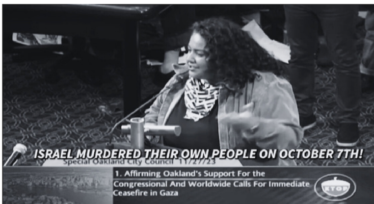
Oakland City Council meeting, November 28, 2023