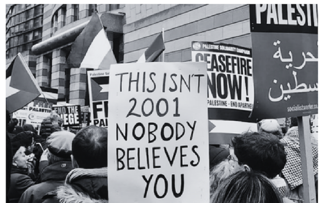
A sign at a London pro-Palestinian march, December 9, 2023.

THE JERUSALEM INSTITUTE OF JUSTICE CALLS UPON ALL CONCERNED INDIVIDUALS AND ORGANIZATIONS TO SUPPORT THE PASSAGE OF LEGISLATION THAT FORBIDS THE DENIAL OF THE OCTOBER 7 ATROCITIES, PREVENTING ANTISEMITISM AND ENSURING JUSTICE FOR THE VICTIMS.