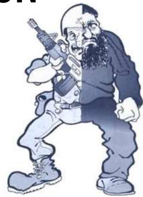
Al-Fateh: Issue 10, June 2003

"ALL MUSLIM CHILDREN ARE THE HOPE FOR THE FUTURE AND BY THEIR HANDS, WITH ALLAH'S HELP, THE ACCURSED JEWISH STATE WILL BE TOTALLY DESTROYED."