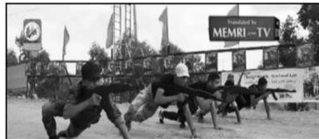
A video posted a pro-Hamas Youtube account shows children undergoing military training in an Izz Al-Din Al-Qassam summer camp 2016

Israel Defense Forces, The Status of Children in Gaza (25 January 2018), https://www.idf.il/en/mini-sites/the-hamas-terrorist-organization/the-status-of-children-in-gaza/ .