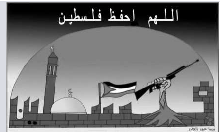
"God Save Palestine" from "Al-Fateh" Issue 109, October 1, 2007

"CHILDREN HAVE BECOME A TOOL FOR WAR- IDEOLOGICALLY CONDITIONED AND USED OPERATIONALLY IN HOSTILITIES."