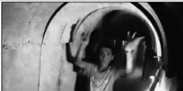
Hamas turns tunnels into summer attraction, July 2016

"CHILDREN HAVE BECOME A TOOL FOR WAR- IDEOLOGICALLY CONDITIONED AND USED OPERATIONALLY IN HOSTILITIES."