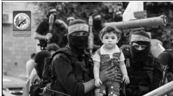
A Hamas militant holds up a toddler during a military parade in July, 2017