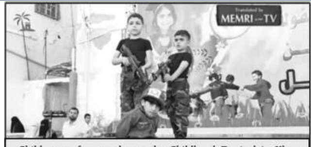
Children perform a play at the Childhood Festival in Khan Yunis, 2016