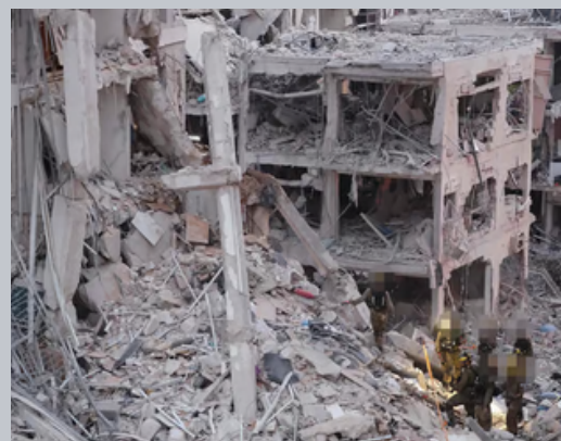
Jack GUEZ / AFP