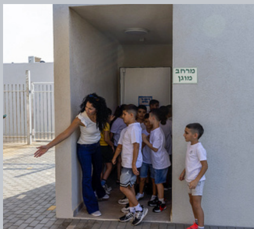
eClinicalMedicine; Times of Israel

Iran's offensive paralyzed Israel's education sector , collapsing the boundary between learning and survival, leaving hundreds of thousands of students vulnerable to continuous 'Red Alert' threat conditions .